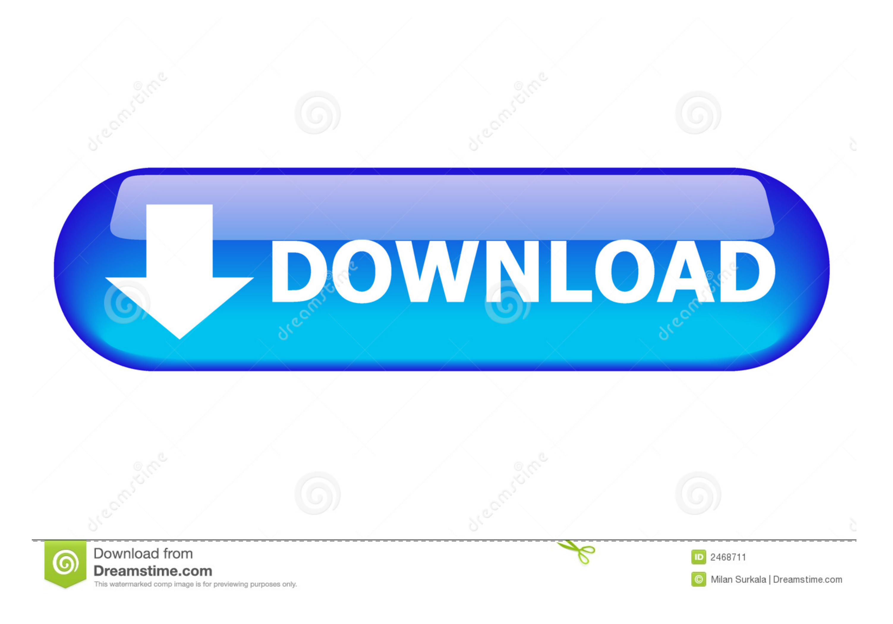
HD Online Player (godzilla 1998 Hindi Dubbed Movie Dow)